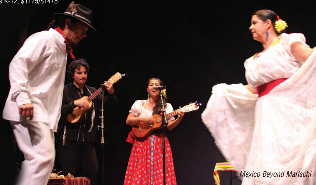
Mexico Beyond Mariachi

NEW: VOCAL TRASH Described as, “Glee Meets Stomp”, this green minded ensemble delights audiences, globally, on a relentless pursuit to bring people together utilizing the universal language of song and dance. The “Think” program uniquely promotes green sustainability and anti-bullying through popular music and urban dance. The cast is made up of young award-winning professionals utilizing their craft for meaningful and lasting results. Vocal Trash; Grades K-12; Price on Request