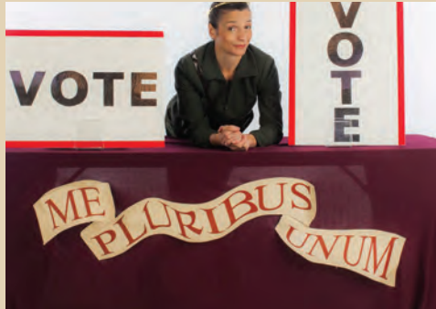
Me Pluribus Unum

than democracy (no questioning necessary, no thinking involved!) she points up the value of civic participation and involvement in our government. Her analysis of the American system covers the separation of powers, how laws are passed, taxes and freedom of speech. At the end, she demands a vote so she can achieve her American Dream: to become queen of the greatest nation on earth! Felicity Jones; Grades K-2, 3-12; $750/$1250