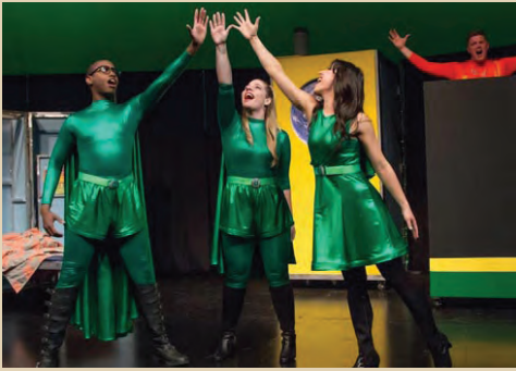
Gabi Goes Green