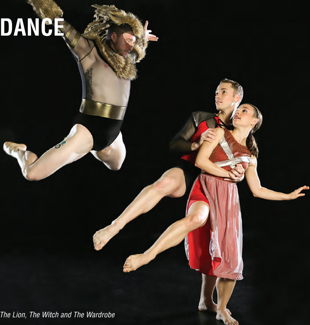
The Lion, The Witch and The Wardrobe