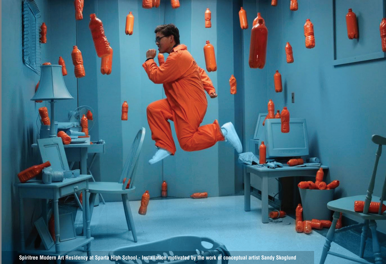
Spiritree Modern Art Residency at Sparta High School - Installation motivated by the work of conceptual artist Sandy Skoglund