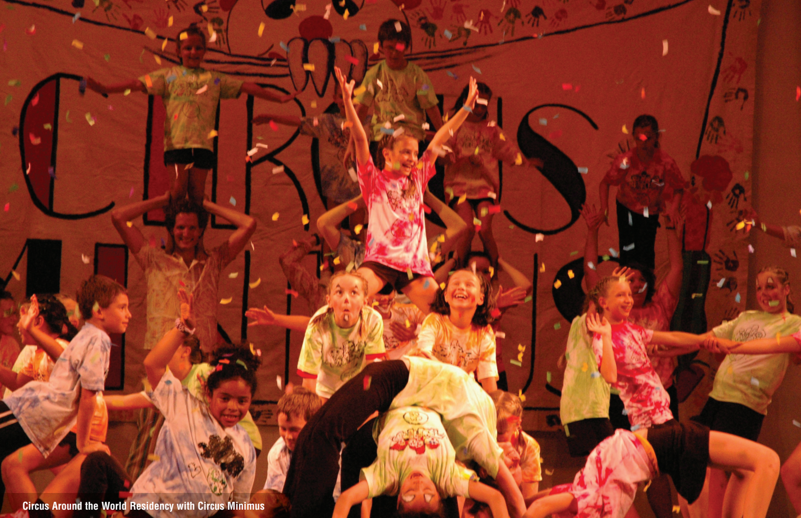
Circus Around the World Residency with Circus Minimus