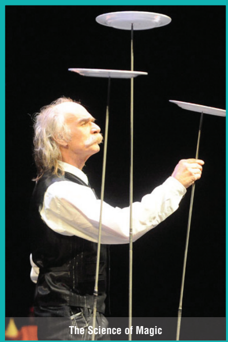
The Science of Magic

ARITHMETICKLES is an interactive, Math Game Show that involves students in the learning process. Through a skillful blending of audience participation, comedy, mime and theatrical effects, the fast-paced math games and skits capture the attention of children in grades K-8. Arithmetickles doesn't aim to teach math but to make it so entertaining that students will want to learn and understand everyday math. ArtsEcho Productions; Grades K-2; 3-5; 6-8; $945/$1590