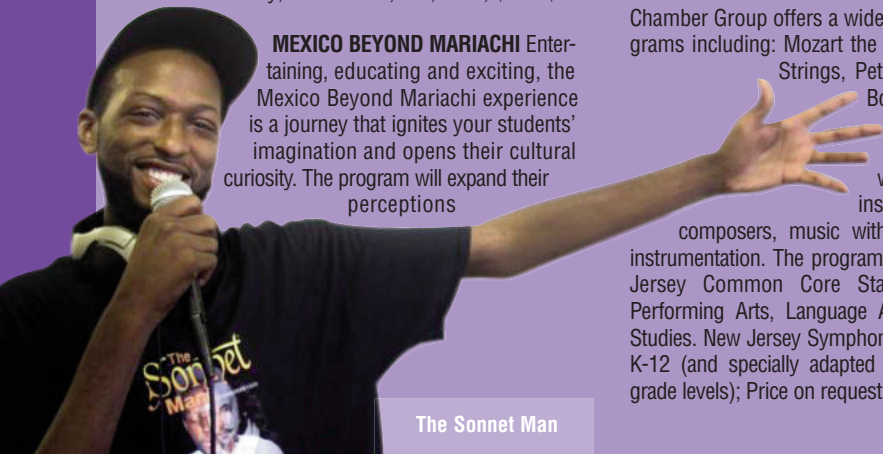
The Sonnet Man